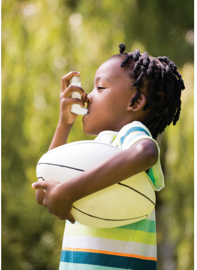
Air pollution exposure can lead to significant risk for developing respiratory disease and cancer. Children are especially vulnerable.

Children are especially vulnerable to the effects of toxic air pollution. In addition to daily exposure to toxic pollution in the