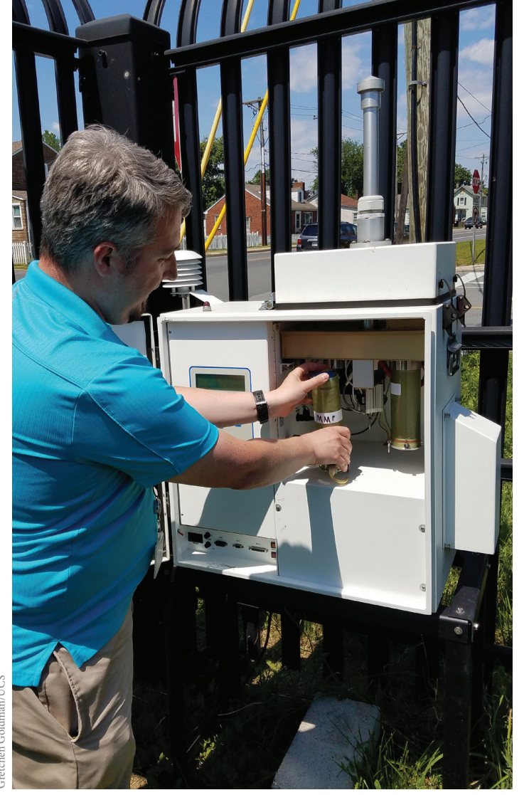
Regular monitoring of air quality near pollution sources is crucial to understanding community exposure to harmful pollutants.

be identified before they lead to disasters. Locally, cities and counties must do a better job of enforcement in areas of "jurisdictional overlap." There must be an accountability mechanism in place for communities to enforce existing ordinances, especially those with a goal of protecting public health.