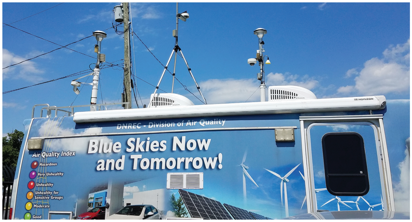
Mobile air monitoring stations like this one from the Delaware Department of Natural Resources and Environmental Control can allow communities to obtain air pollution data from locations without permanent monitoring but where pollutant levels may be high.

requirements for oil refineries to monitor benzene at their fenceline by including other toxic air pollutants such as toluene and xylene, and should require fenceline monitoring at other major industrial sources.